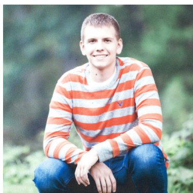
Justin Numerick Samuel McKeown Memorial Scholarship