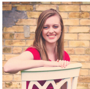
Emily Lowery Rodney and Rena Schad Memorial Scholarship